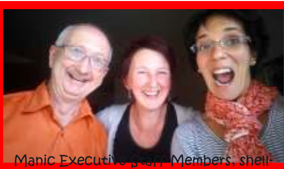
Manic Executive Staff Members, shell-shocked from entertaining the multitudes (out of shot).