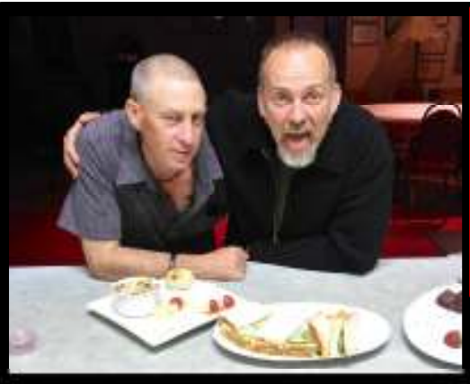
Starving Access Programme Makers protect their share from the multitudes (out of shot)

Okay. Moving on. Did you enjoy the ArrowFM Christmas Party? For those of you who missed it, here are some suitably fuzzy fotos of that riotous Bacchanalia.