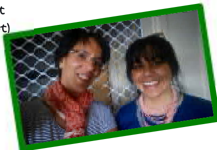
Associate Manager and Executive Board Member take break from feeding the multitudes (out of shot)