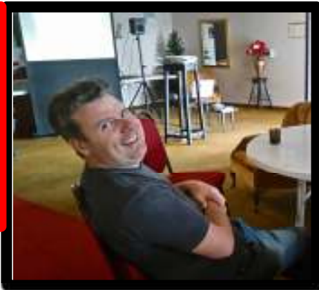
WaiTV CEO prepares to pitch collaborative initiative to the multitudes (out of shot)